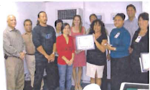
Outstanding/Good Housekeeping Center of the Quarter Human Resources Division