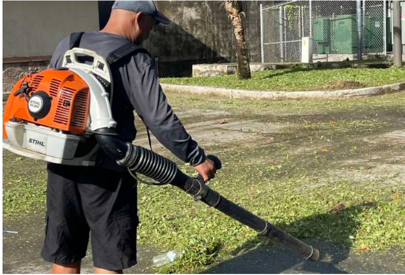
The Transportation and Stevedore personnel conduct a clean up at Southern High School.