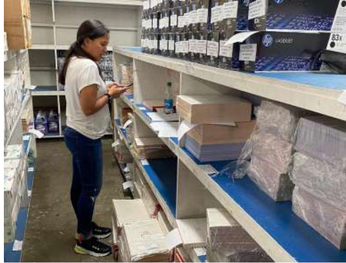
Employees from Finance conduct annual inventory to close out the FY 2022.