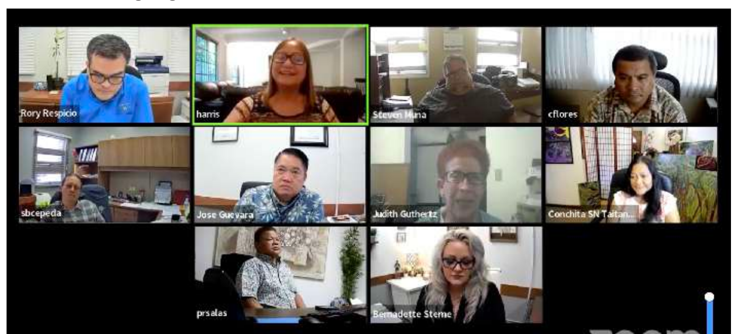
September Port CFS Building to get Facelift

The Port Authority of Guam Board of Directors approved an award to RN Builders to begin work on the PAG CFS Building. The Board voted unanimously to approve the Invitation for Bid award to RN Builders for the painting of the exterior, interior, and roof coating of the PAG CFS Building (IFB-PAG-CIP-022-007) during their regular Board of Directors meeting held on September 29, 2022.