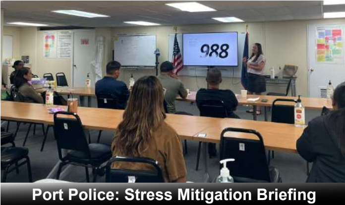
Port Police: Stress Mitigation Briefing