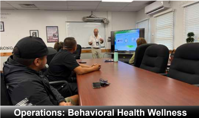
Operations: Behavioral Health Wellness

Port employees continue to prioritize their health and well-being through a series of wellness events hosted by various divisions.