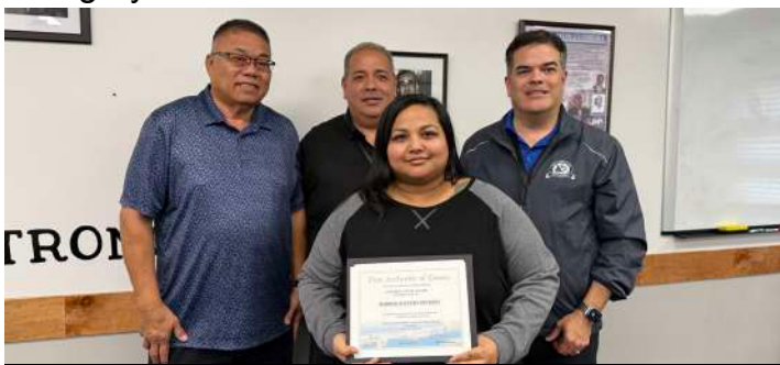
Harbor Master's Division