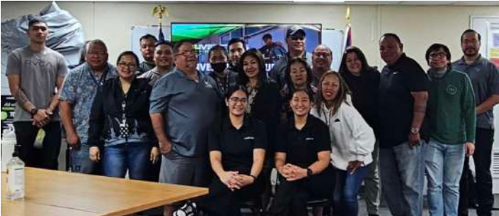
Livestrong by General Administration