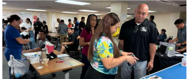
Biometric Screening by EQMR Division

The Port Authority of Guam continues to demonstrate its commitment to overall wellness through various initiatives, including educational programs, fitness activities, and community engagement. By prioritizing physical, mental, and emotional well-being, the Port strives to empower its workforce to lead healthier lives, not only investing in its employees but also contributing to a stronger, healthier island community.