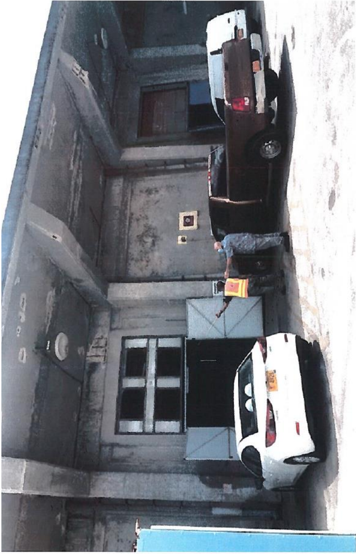
PROPOSED LOCATION OF METAL CANOPY FRONTING BUILDING MAINTENANCE (60' X 31')