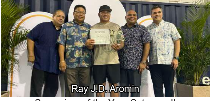
Supervisor of the Year Category II