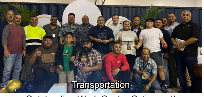
Outstanding Work Center Category II