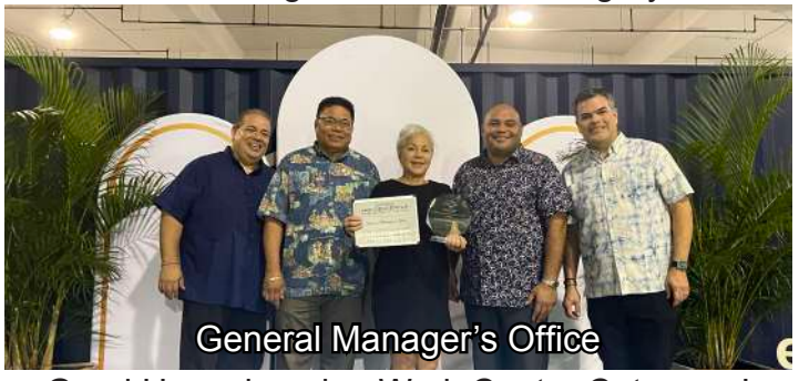
Good Housekeeping Work Center Category I