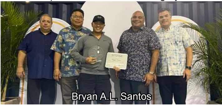
Supervisor of the Year Category II