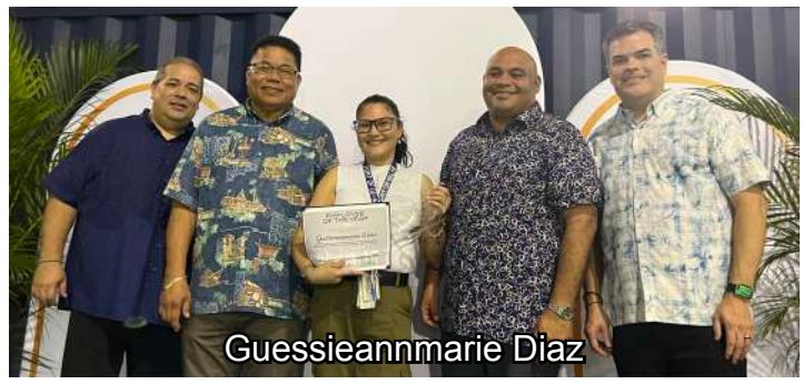
Employee of the Year Category I