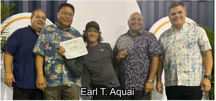
Employee of the Year Category II