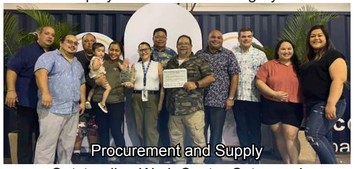
Outstanding Work Center Category I