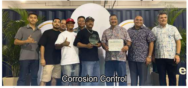
Good Housekeeping Work Center Category II