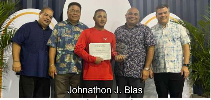
Employee of the Year Category II